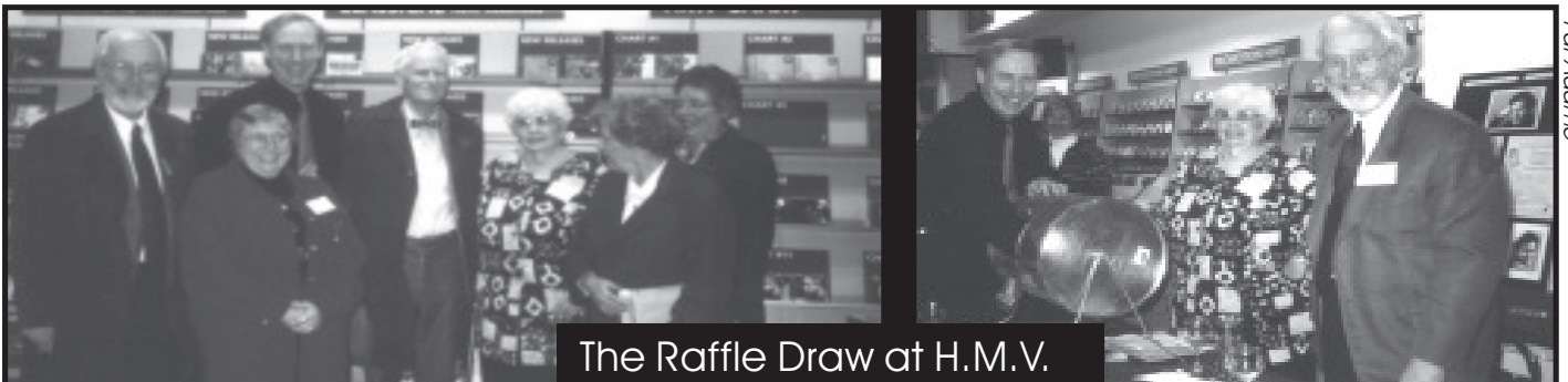
The Raffle Draw at H.M.V.

Perhaps it is the opera critic who needs ten additional years of study and development of his craft before submitting such damaging judgments in the public press.