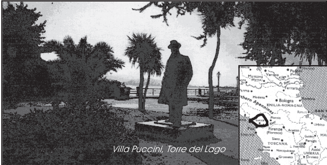
Villa Puccini, Torre del Lago

Last April I stayed for about a week just outside of Lucca, a rampart-encircled mediaeval city located between Pisa and Florence. Even if I hadn't done some reading about Lucca before I arrived, the presence of a life-size bronze statue of Giacomo Puccini in a little square just off one of the main streets would indicate whom the Lucchese regard as their most famous son. Right in this square (across from the inevitable Trattoria Puccini) is the building where the composer was born and spent his early days