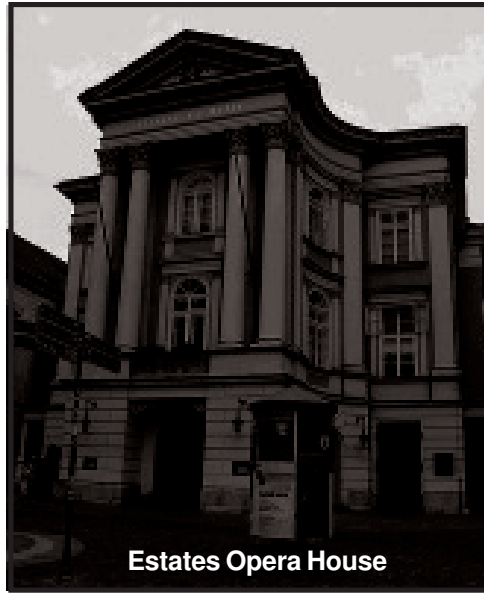
Estates Opera House