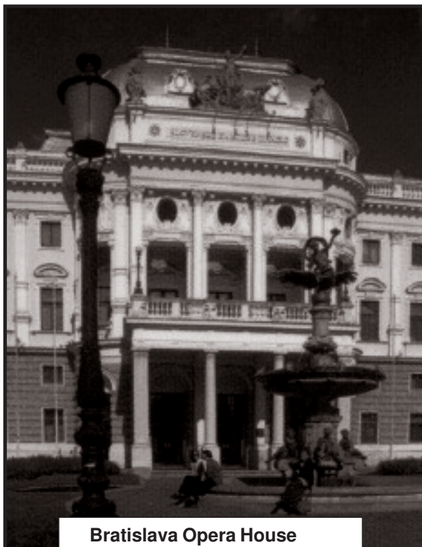
Bratislava Opera House

Our next stop was Budapest for our third opera in as many nights — and what a performance we got! To start with, the Opera House which opened in 1884 with Franz Joseph in attendance is absolutely beautiful. Franz Joseph decreed that it could not have an auditorium larger than Vienna's but instead they built the second largest backstage in Europe, second only to Covent Garden's! Fortu-