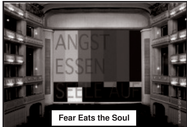
Fear Eats the Soul

That evening was the highlight we had all been eagerly anticipating: an opera at the beautiful Vienna State Opera House! First built in 1861-1869, it was rebuilt as soon as possible after the bombing of World War Two, and so has some modern salons and, incidentally, a safety curtain with an artistic design that changes each year, thanks to Magna International!