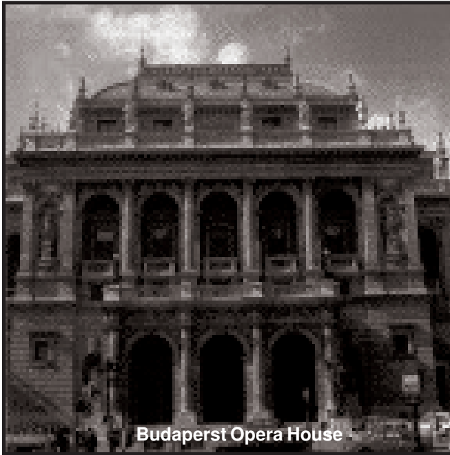
Budapest Opera House