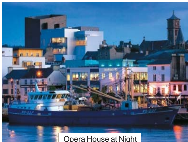
Opera House at Night

With Irish heritage, a given name with an “Irish” spelling, and a hankering for hearing unusual operas and seeing new opera houses, it was a given that the Friends of the NACO’s October tour to Ireland, including Wexford Festival Opera (WFO)’s new Opera House, would find me an eager participant! What a wonderful little opera house it is - Ireland’s first purpose built opera house! It took them three years and only $50 million, but the WFO Board are very proud that they managed to squeeze a new larger, almost secret opera house into the same centre town site as before! The original unpretentious streetscape now opens into a lovely foyer with stairs to the many reception areas, rooftop terraces and 5 bars, where the well-dressed audience in black tie and evening gowns mingled and drank their glasses of champagne! (Hey - this was the opening weekend of both the house and the season!) The classic horseshoe-shaped auditorium is gorgeous, lined with black walnut wood from Canada for superb acoustics! They now have 770 comfortable seats, twice the old number, with no one too far from the stage to see or hear well - really very like the Canadian Opera Company’s new house, although smaller.