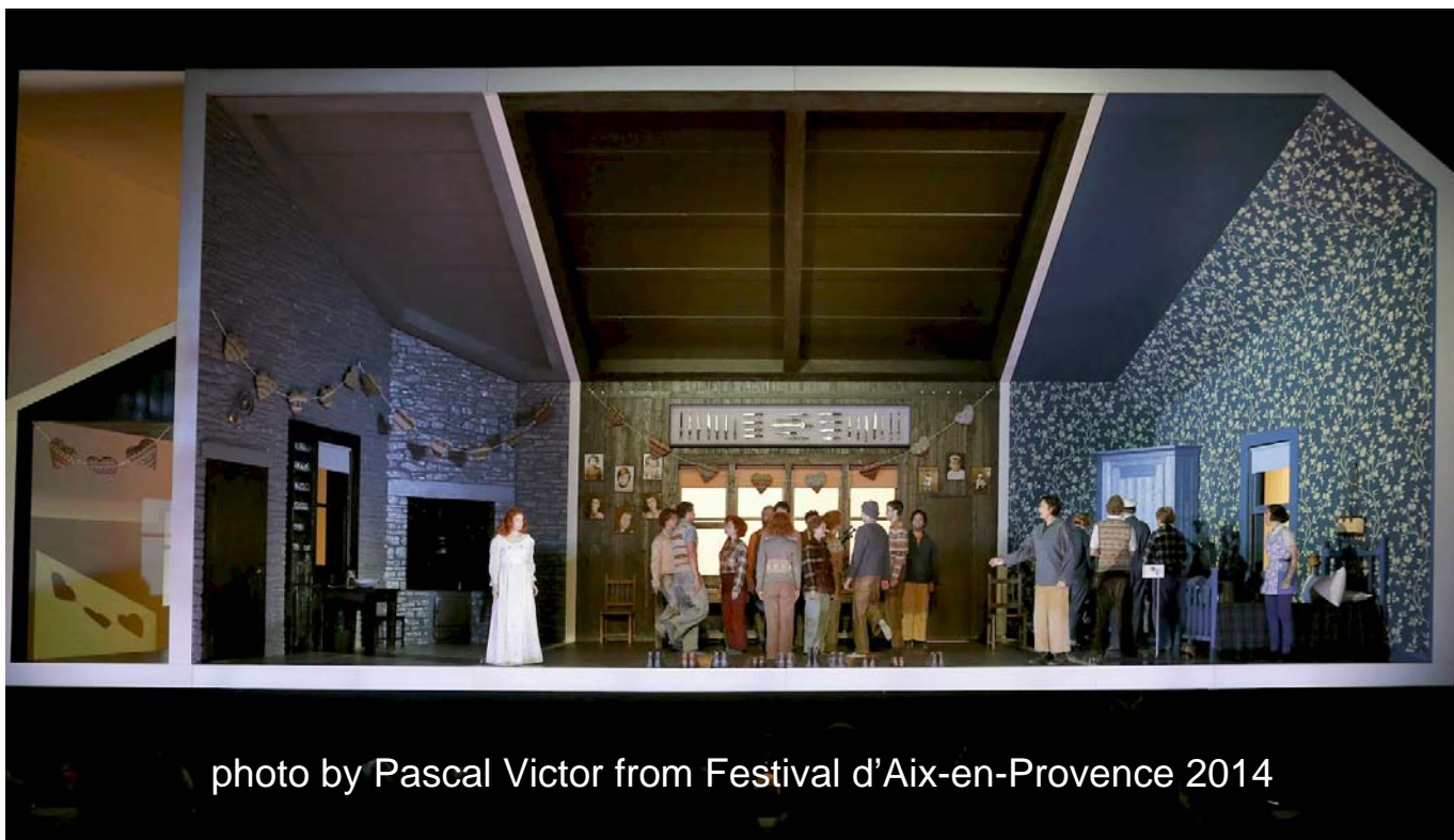
from Festival d'Aix-en-Provence 2014

hundred years. A new edition of the score was published in the 1960s which led to a revival of interest in the piece and this makes the setting of the new production feel particularly fitting. The modern setting is also enlightening in that it serves to highlight themes. There are hints in the staging of sexual assault and domestic abuse. This, along with a modern-feeling sort of slut-shaming of Ginevra, enhances our appreciation of the experience of the protagonists, by appealing to our modern sensibilities. The ballet sequences of Handel's music are performed by stunning puppetry, created by the same team that brought us the fabulous puppets seen in the Met's recent production of Madama Butterfly . The sequences depict a prediction of what might be to come: a happy ending with marriage and babies, or the exile of