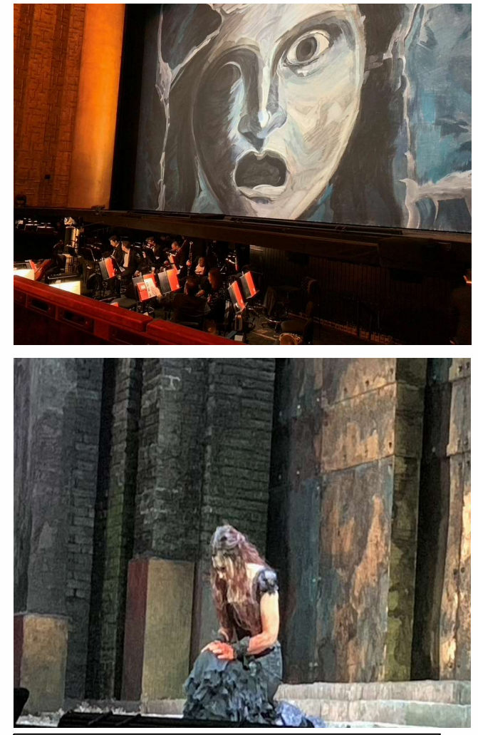
The magnificent Sondra Radvanovsky acknowledging her ovation following the conclusion of the opera

The season opened with this magnificent new production by David McVicar of Cherubini's rarely